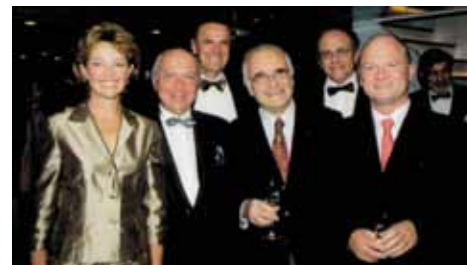
Figure 5. International attendees at the Annual CNS meeting in 2001, reflecting the CNS reach into world neurosurgery.