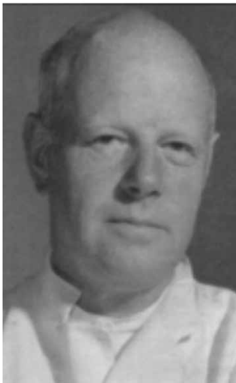
Figure 1. Herbert Olivecrona, of Sweden was the first CNS Honored Guest at the 1952 CNS Meeting in Chicago.