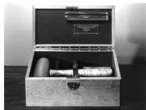
Figure 3. “The international Gavel”, sponsored by the CNS, was presented on behalf of the five American National Societies to the World Federation of Neurosurgical Societies at its first World Congress in Brussels, Belgium in 1957